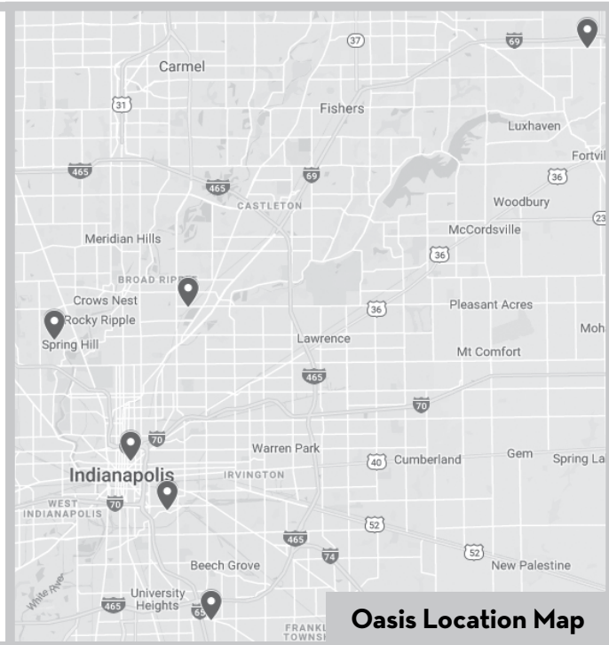
Oasis Location Map

MON: Book Club Oasis (First Monday of the Month), Room 8. Pendleton Oasis, 9479 W Campfire Dr., Pendleton TUE: Journey through the Bible Oasis, Room 6. Mornings with God Oasis, Cafe at 10:00 am. Westside Oasis, 4465 Clover Dr., Indianapolis. WED: F·R·I·E·N·D·S Oasis (age 20-30 something), Room 7. THU: Downtown Oasis, 225 E North St. #2500, Indianapolis. Southside Oasis, 3905 Shelbyville Road, Indianapolis at 6:30. Thursday Evening Oasis, Room 6