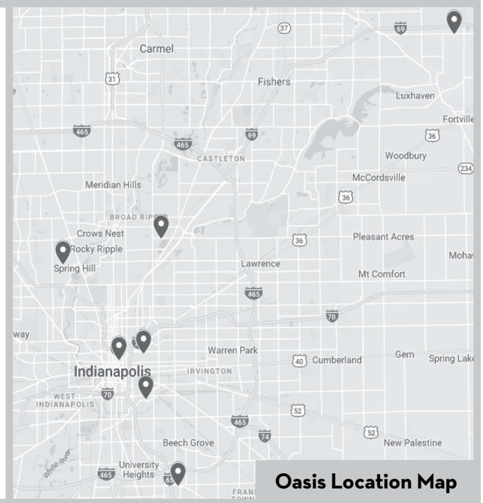
Oasis Location Map