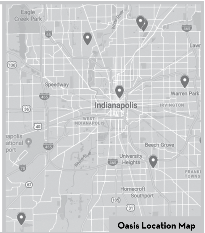
Oasis Location Map