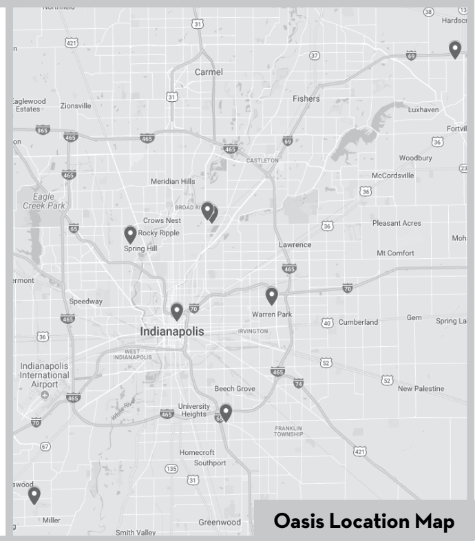
Oasis Location Map